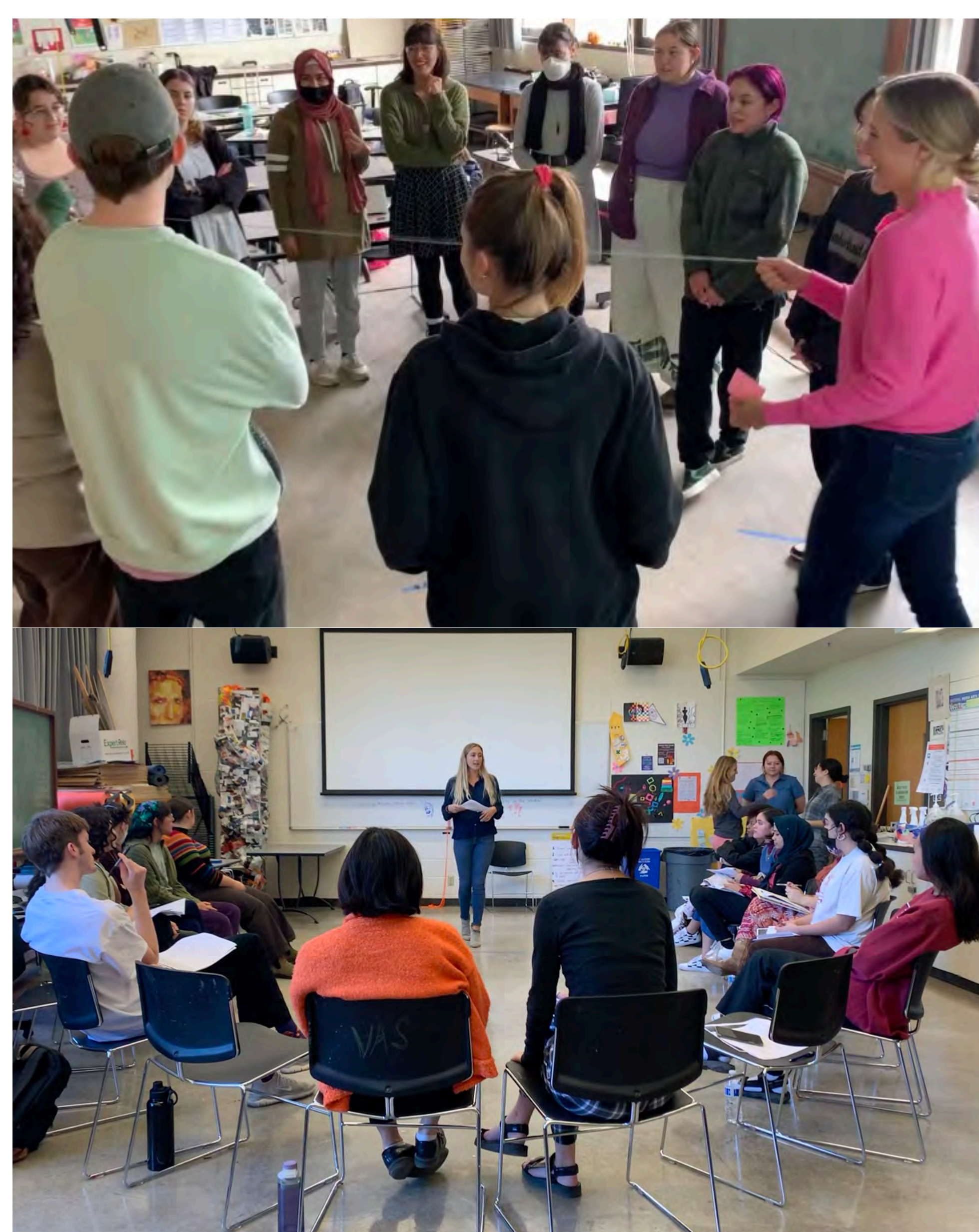
Two pictures taken during the live training sessions at the University of Texas at Austin in the Fall of 2022.

What research-based strategies can be used to teach pre-service students at one university how to prepare for “difficult conversations” in their future careers as art educators?